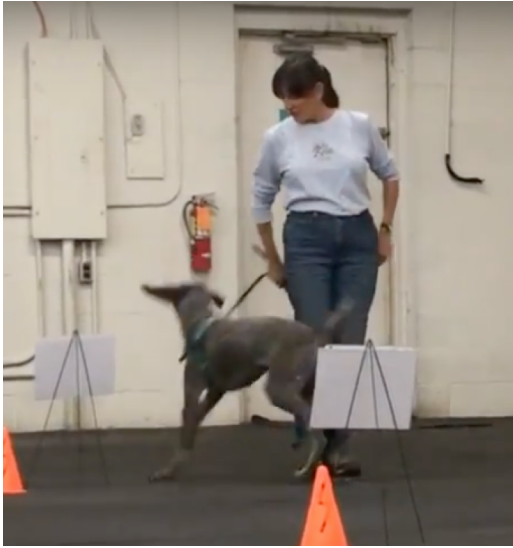
Lure the dog behind you with your right hand