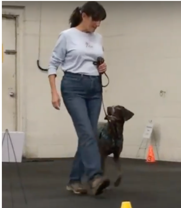
Forward – the leash will be in your left hand.